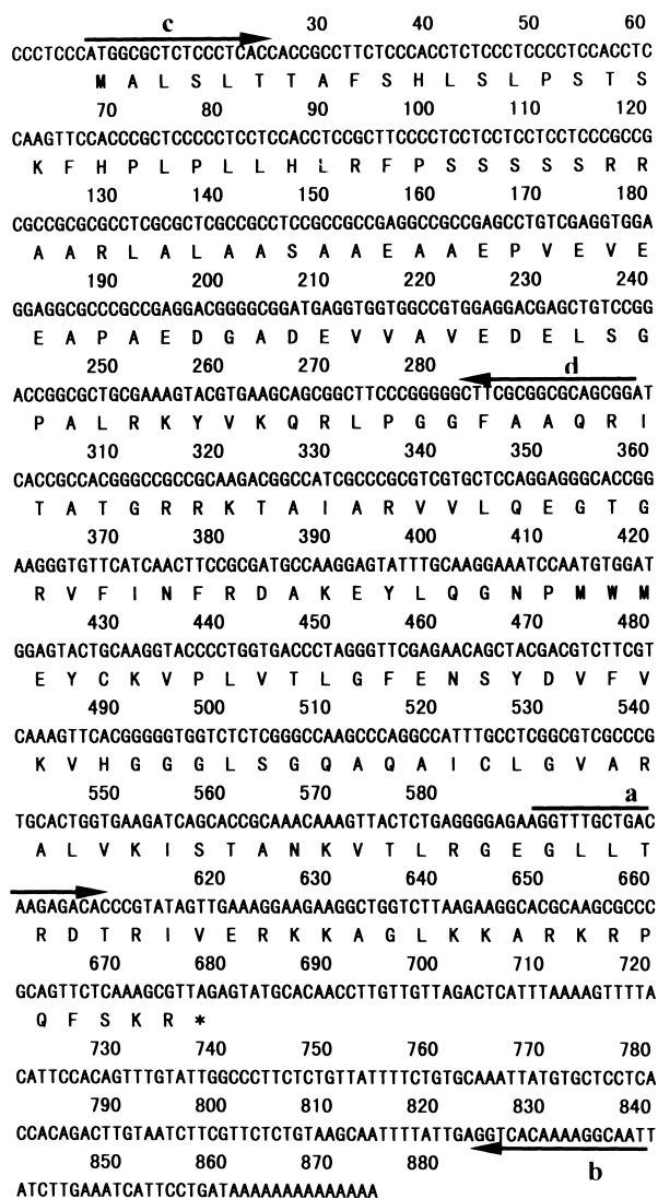
Fig. 1. Nucleotide and deduced amino acid sequences of cDNA for chloroplast RPS9 of rice ( Oryza sativa L cv. Nipponbare). The stop codon is denoted by an asterisk. Arrows labelled a and b indicate the positions of the primers used for amplification by RT-PCR and arrows labelled c and d indicate the positions of primers used for GFP construction.

Genes for RPS9 have been identified in many bacterial genomes [12–15]. Similar genes have also been identified in the yeast nuclear genome (for mitochondrial RPS9 (MRPS9): [16]) and in the chloroplast genomes of lower unicellular plants [17–19]. In Escherichia coli , the RPS9 is cross-linked to the L5 and L18 proteins of the large subunit. It was concluded that the S9 protein is located at the interface between